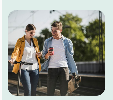
Environmental management ISO 14001

Browse our growing range of courses and qualifications today.